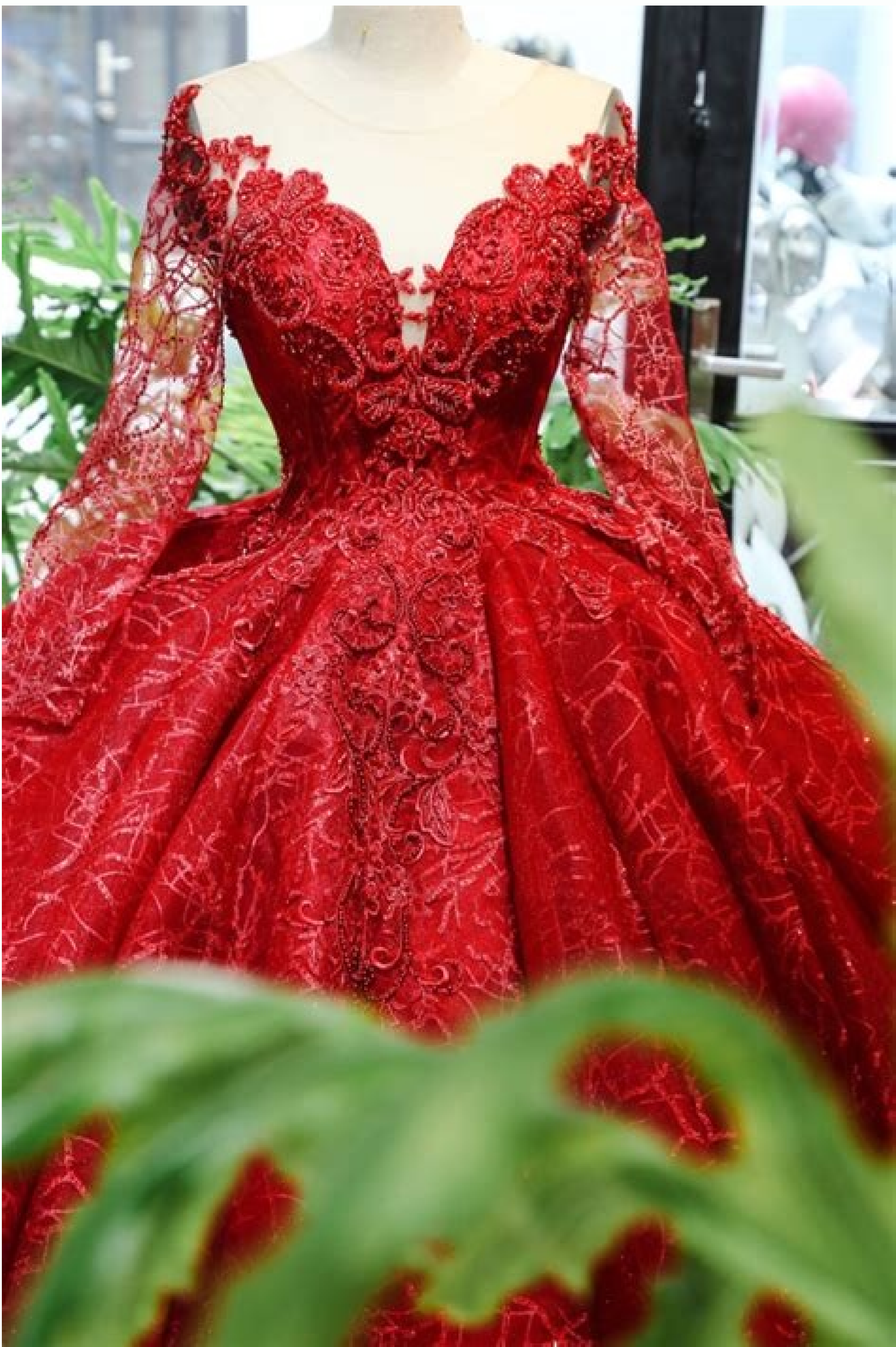
Long red formal dress with sleeves