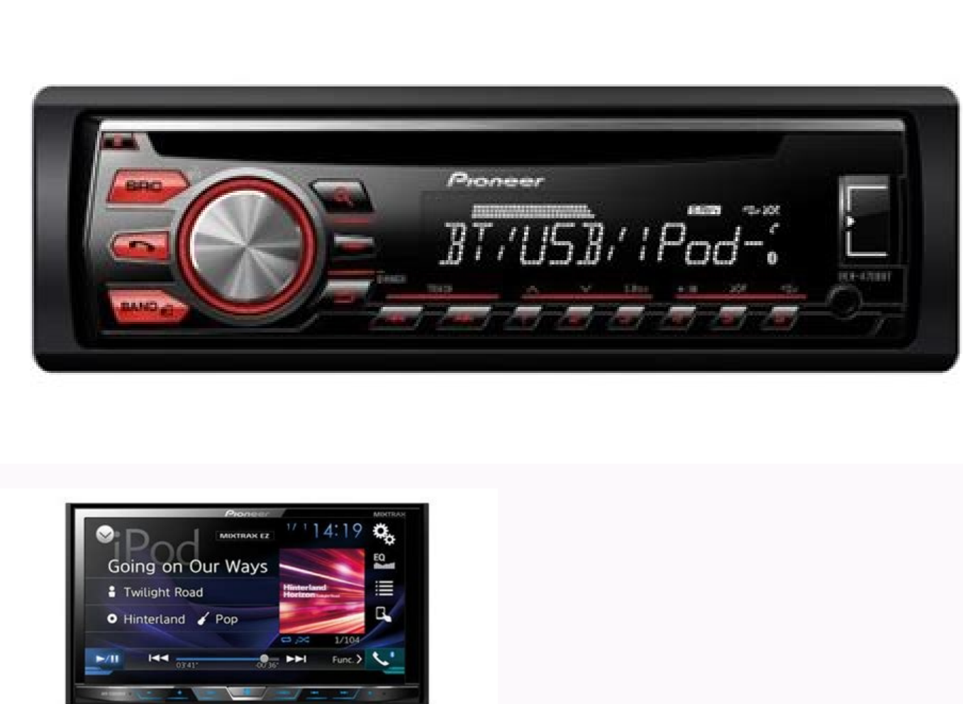
Pioneer deh-150mp car stereo system. Pioneer deh150mp manual. Pioneer car stereo deh-150mp manual.